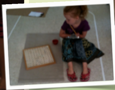
At work in the Coral Room